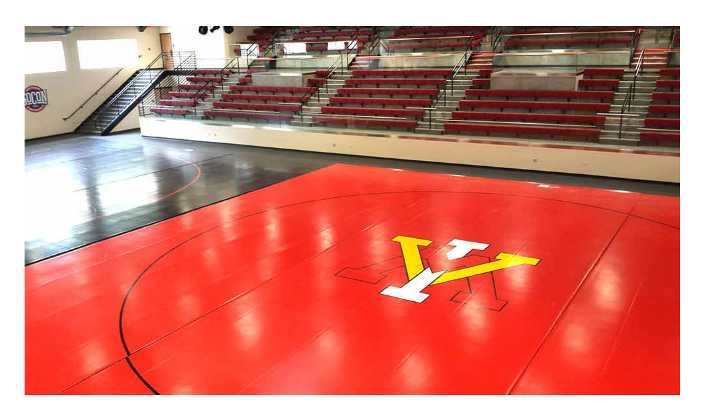
VMI Facilities Improvements Nearing Completion Continued

River north of the city. The parking garage bridges the stream and will be unseen by most visitors. The embankment is contained by a more-than-20-feet-high concrete retaining wall. Two bridges – one for maintenance vehicles and one pedestrian walkway – will cross over US Route 11 and connect this building with VMI's main campus. More than 100,000 sq. ft. of concrete pavement has already been placed, with more to come. In addition to offices and spectator seating, the building will feature an NCAA-regulation size indoor