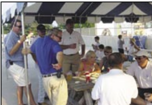
Members and guests relax at the game.

This event, while in its infancy, looks to become a regular mid-summer feature of the Council's schedule. The Salem facility is exceptionally nice for a small-market city, and the local team has been playing well.