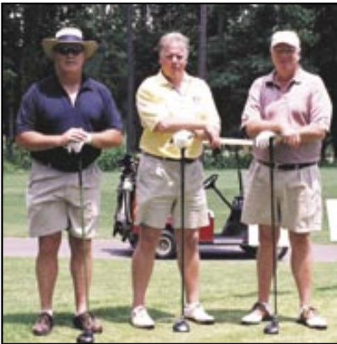
Tournament participants take time out to smile for the camera.

The winner of this year's tournament was Swope and Associates and this win makes the fifth year the company has won the Richmond event on a new course with a greater level of difficulty than the previous course.