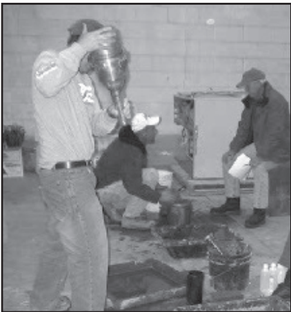
ACI students concentrate on the hands-on component of the examination.

Here the students were able to complete the written exam in a heated, spacious conference room and then move