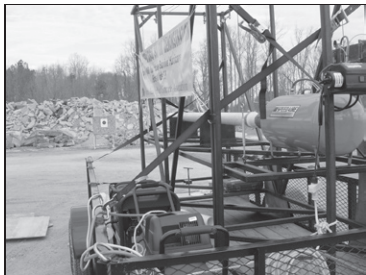
A close-up view of the cannon.