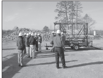
Visitors gather to watch the firing demonstration.

A program is also being developed and registered to provide learning credits in Health and Safety for architects attending the demonstrations and seminars. The visual and mental impact of this demonstration is one that is not easily forgotten.