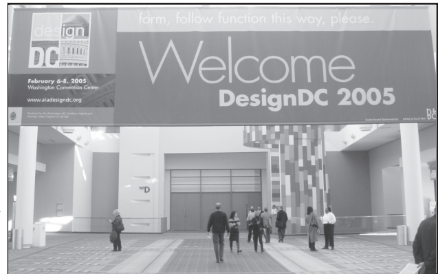
DesignDC 2005 attendees at the Washington Convention Center.

Overall, DesignDC was a well-attended event and offered a great opportunity for networking with design professionals.