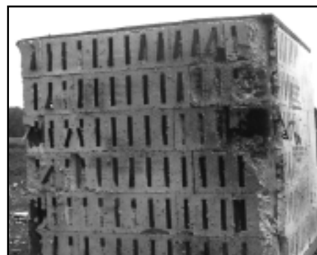
After the Blast

www.forms.org . The team effort that made this event possible, and a successful blast test result has created a strong foundation for the development of additional prospective markets for ICF.